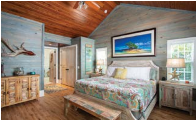
You'll fall in love with the roomy master bedroom suite!