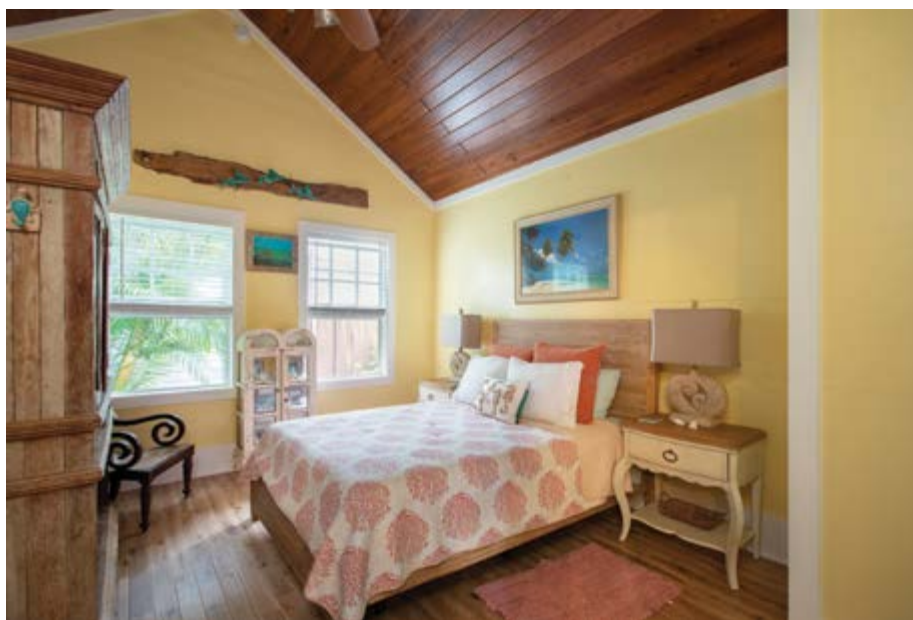
A cathedral ceiling and plenty of wood accents give this guest bedroom authentic Key West flavor.

of-the-art commercial grade stainless steel appliances and copper and bronze fixtures offer plenty of possibilities to create that perfect multi-course dinner