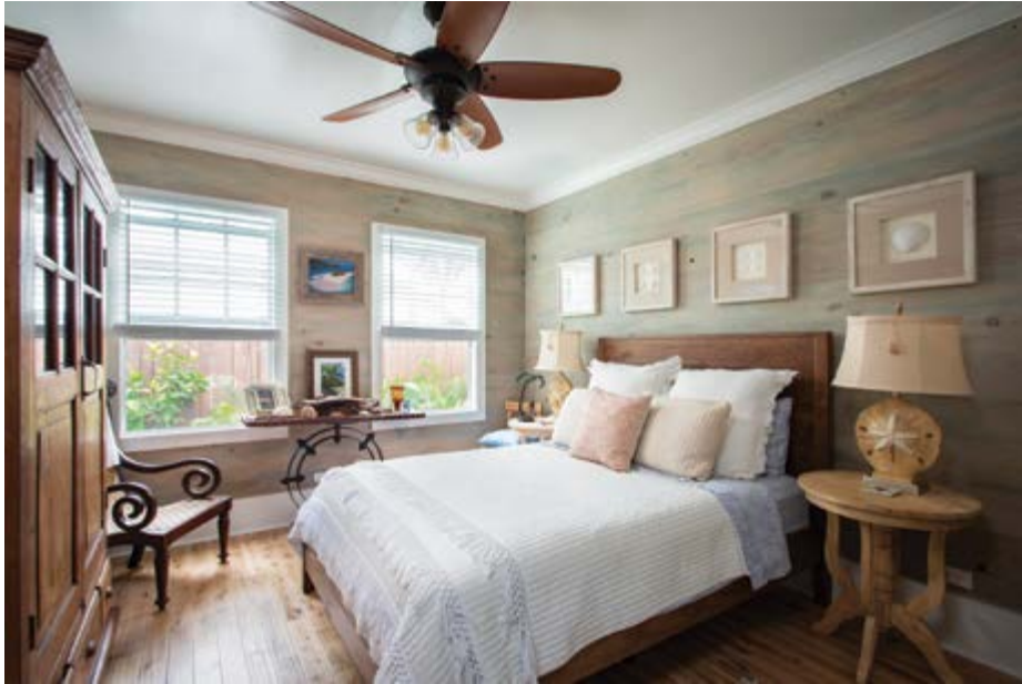
The second guest bedroom also has charm to spare, as well as access to the attic storage space. Photo contributed