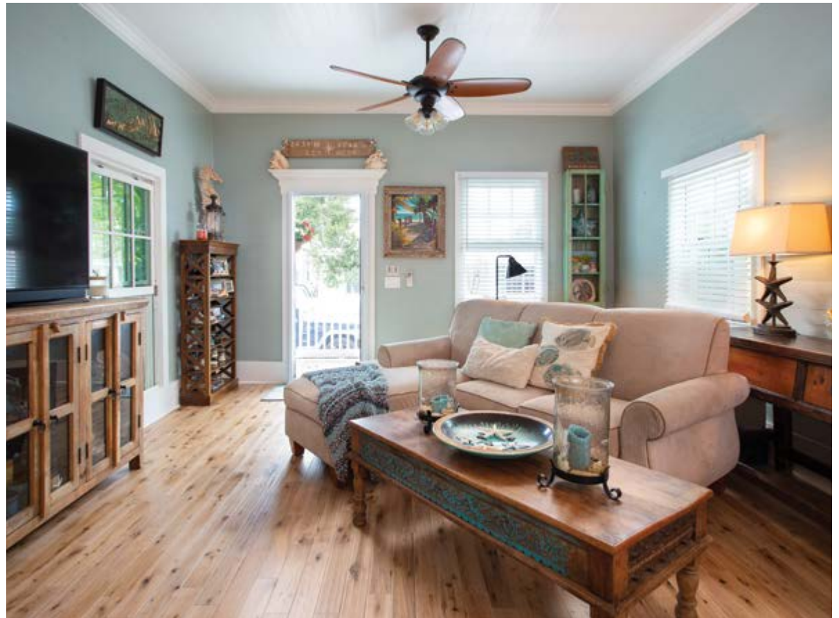
The living room area is a great place to relax or entertain. Photo contributed