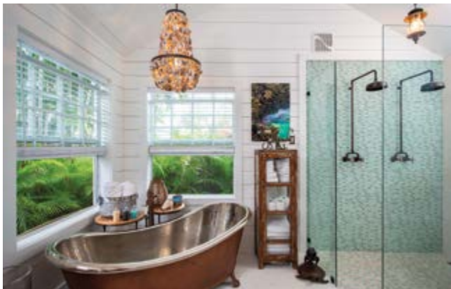
This copper soaking tub and shower for two are highlights of the master bedroom's ensuite bathroom.