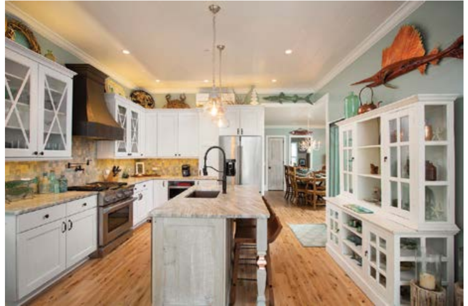
A spacious and well-equipped gourmet kitchen includes top-of-the-line stainless steel appliances and numerous other features.