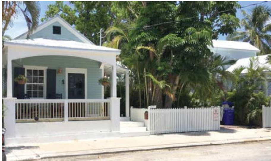
This freshly remodeled home offers 1,800 square feet of living space on a good-sized Old Town lot, with rare off-street parking.

Inside, the spacious living and dining room area is all class, with vaulted ceilings and exposed wood beams. The gourmet kitchen is a chef's dream! Stylish brushed marble and quartz countertops, built-in storage, and state-